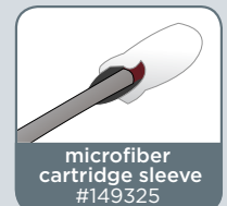
microfiber cartridge sleeve #149325