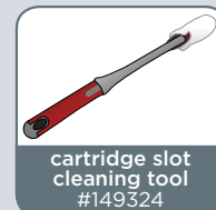
cartridge slot cleaning tool #149324

Order small parts including the new cartridge slot cleaning tool and microfiber cartridge sleeves by calling 1-800-241-COKE