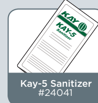
Kay-5 Sanitizer #24041