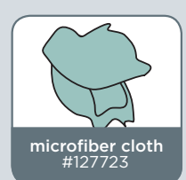
microfiber cloth #127723